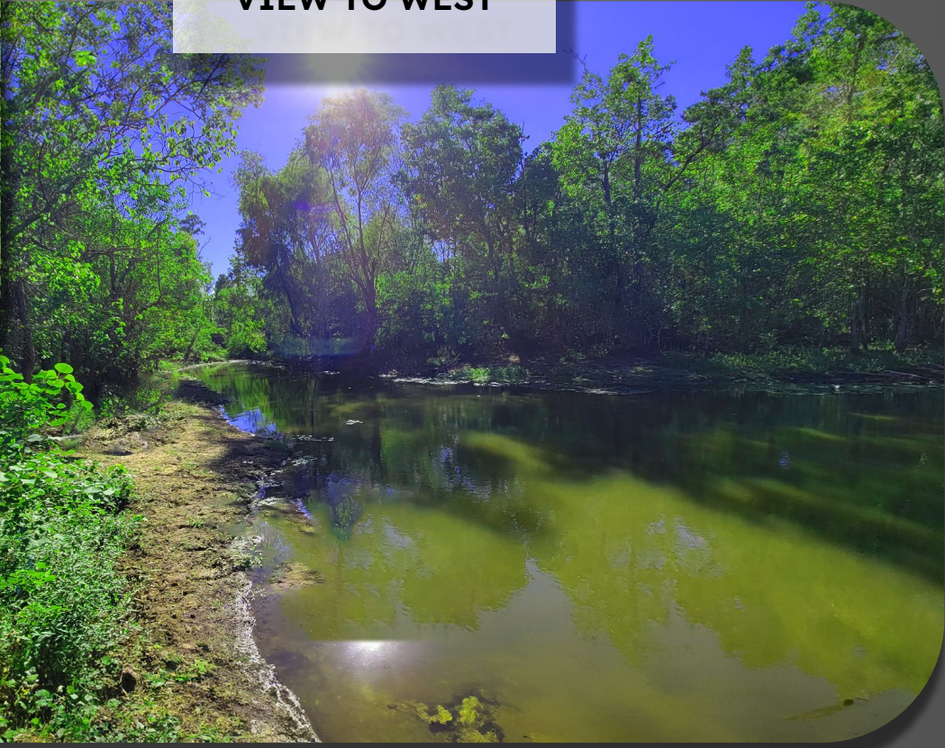
VIEW TO WEST

2831 Goodson Loop, Pinehurst, Tx. 77362 FOR SALE | Surveyed 15.1947 ACRES