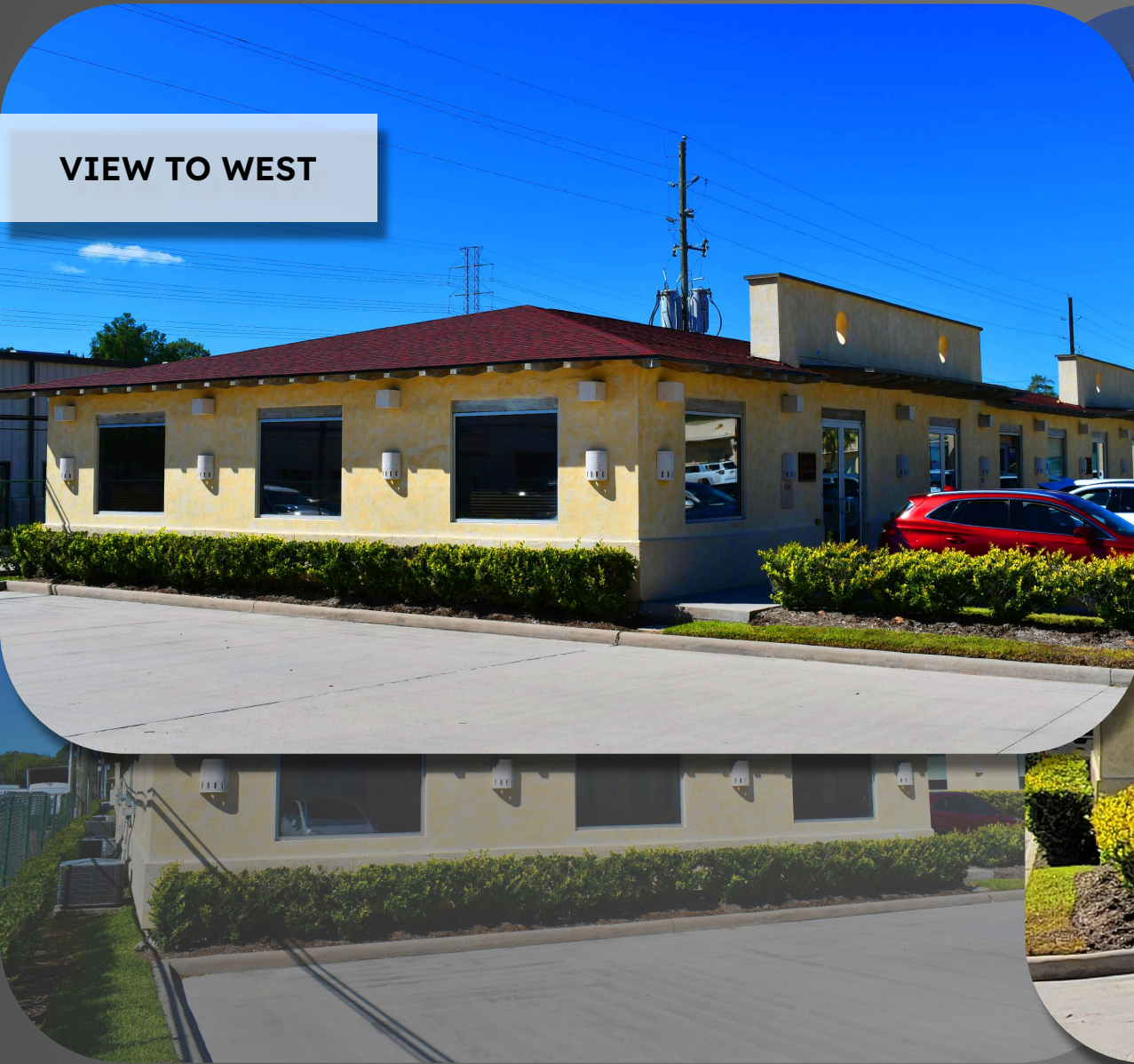
VIEW TO WEST